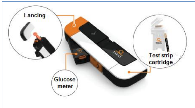
Figure 1: Dario™ Device